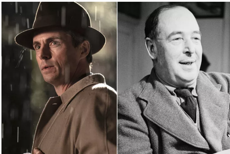
Matthew Goode as C.S. Lewis (left) and C.S. Lewis (right).

The pair of icons find themselves in a fierce debate over the existence of God as the world around them hurtles toward World War II. The ongoing debate forces them to explore personal relationships of the past and present, including Lewis' time serving during World War I.