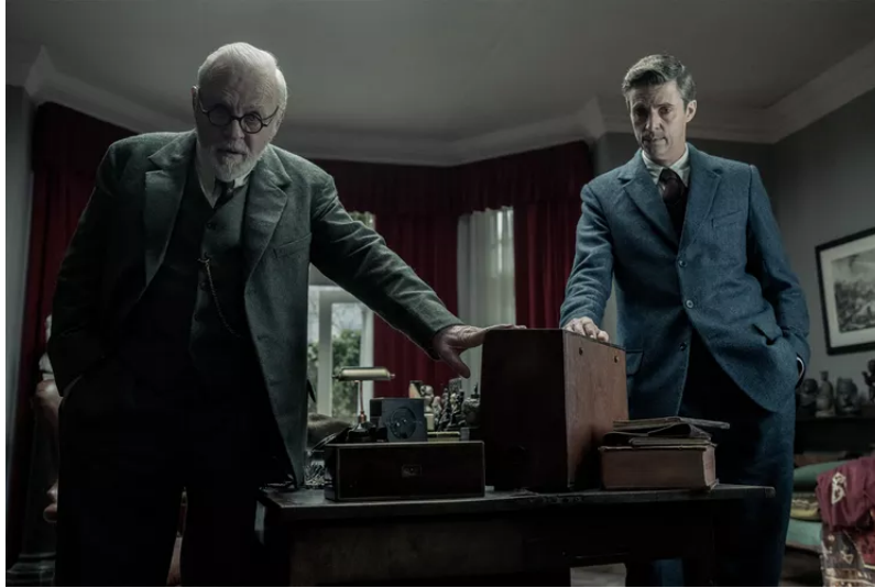
Anthony Hopkins and Matthew Goode in 'Freud's Last Session'.

Watch EW's exclusive trailer reveal in the video above.